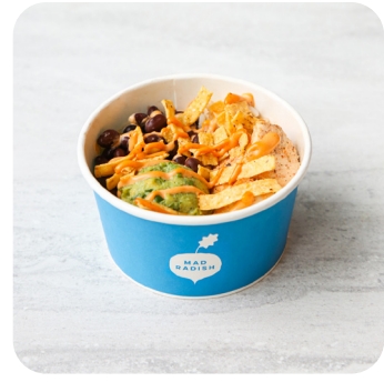
LIL' TACO BOWL - $7

Our chicken is halal-certified, raised in Ontario and 100% natural.